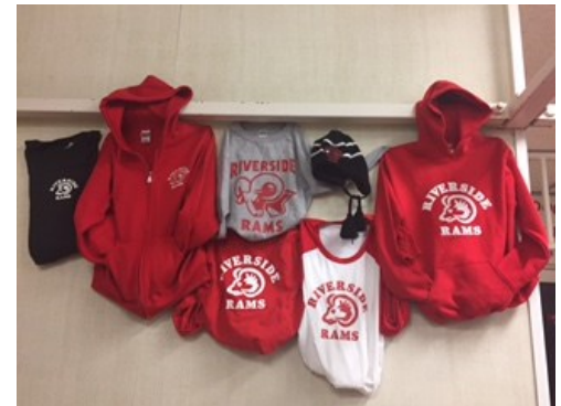
Ram Clothing options available

It is also acceptable to send a note with your child to school prior to their absence, this will avoid a call from the school.