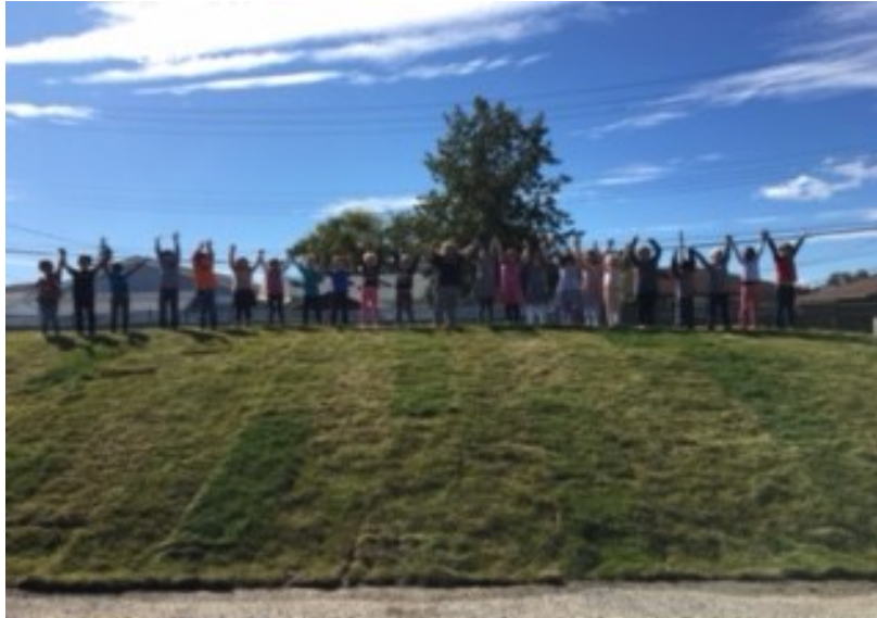
Students enjoying the new hill on the first day of school